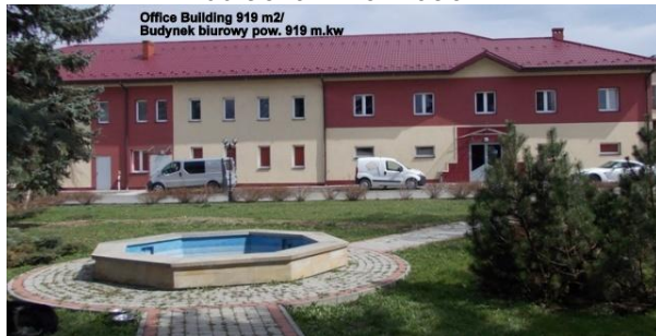
Office Building 919 m2/ Budynek biurowy pow. 919 m.kw