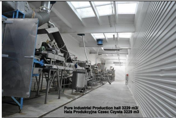
Pure Industrial Production hall 3229 m3/ Hala Produkcyjna Czysta Czysza 3229 m3