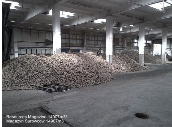
Resources Magazine 14907m3/ Magazyn Surowcow 14907m3